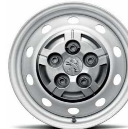
440 Panel & Window Vans