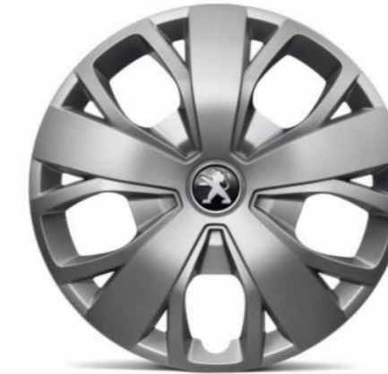
440 Panel & Window Vans