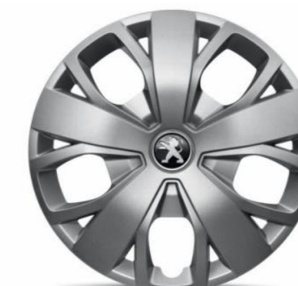
435 Panel Vans