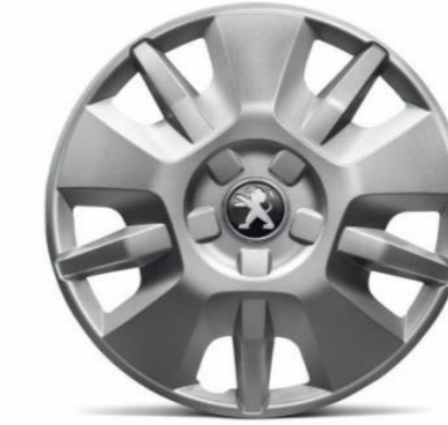
335 Panel Vans